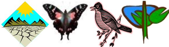
Plant depicted is not the same cultivar as the one being sold.